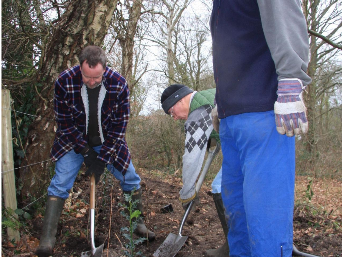
Planting the boundary hedge (Ground frozen solid)