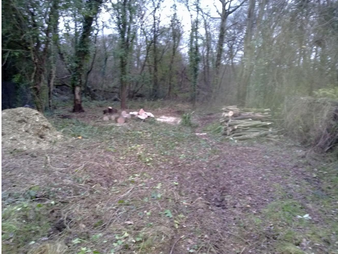
Looking through the gate entrance